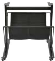
Optional stand for easy movement and storage.