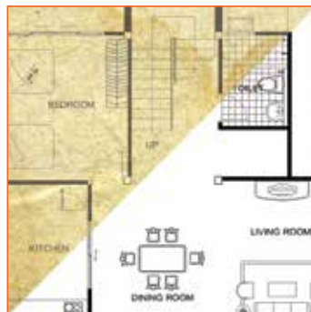
Improve your originals