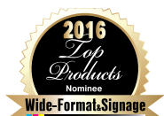
SD One nominated