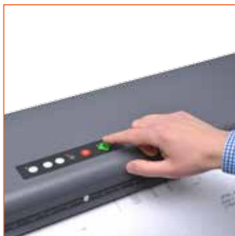
Flexible control panel for easy handling

Scan and document all your architectural, engineering and construction plans in standard file formats directly into your project folders.